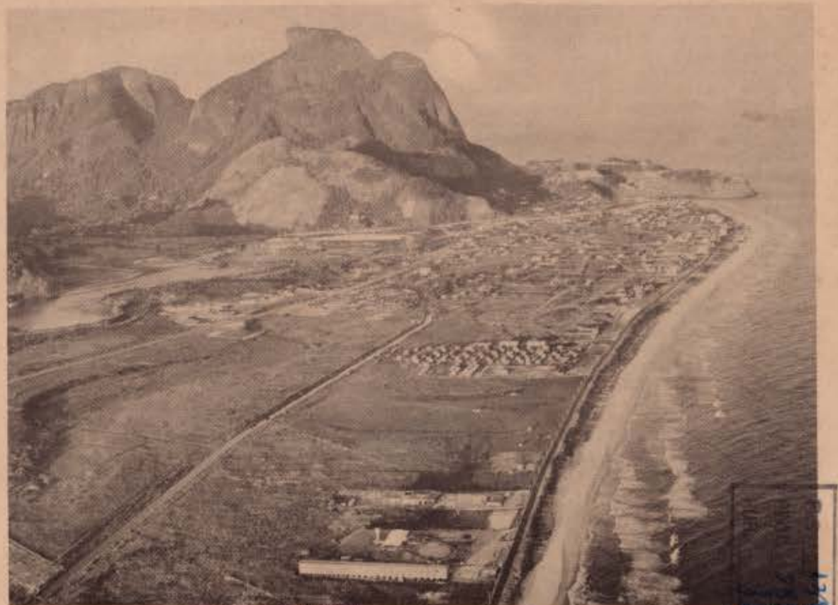
BARRA DA TIJUCA

The commercial centers with about 1,000 shops, will be finished later, in about one year. Whoever comes from the Southern Zone of Rio bathe in the sea at the opportunity.